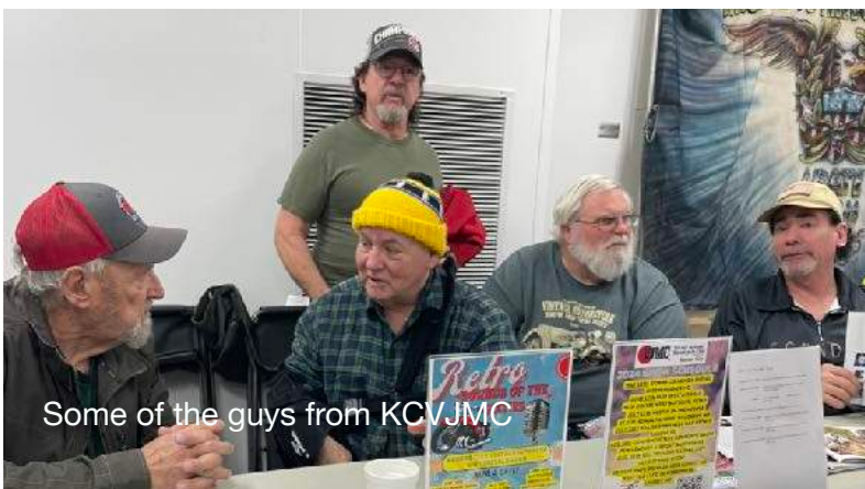
Some of the guys from KCVJMC