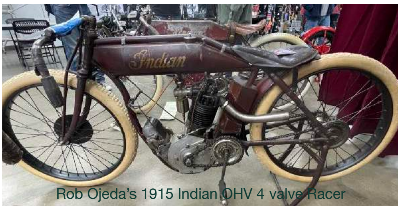
Rob Ojeda's 1915 Indian OHV 4 valve Racer