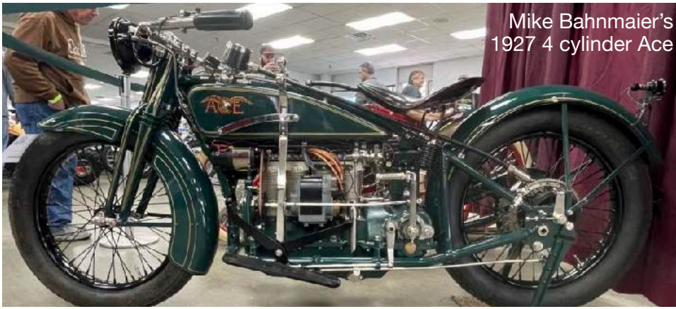
Mike Bahnmaier's 1927 4 cylinder Ace