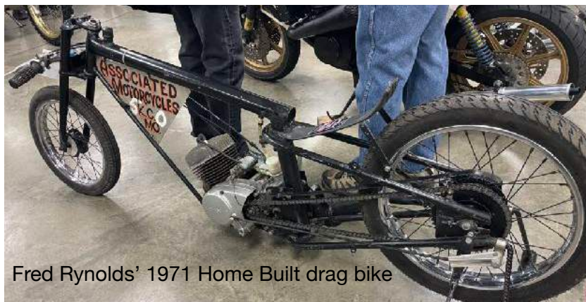
Fred Reynolds' 1971 Home Built drag bike