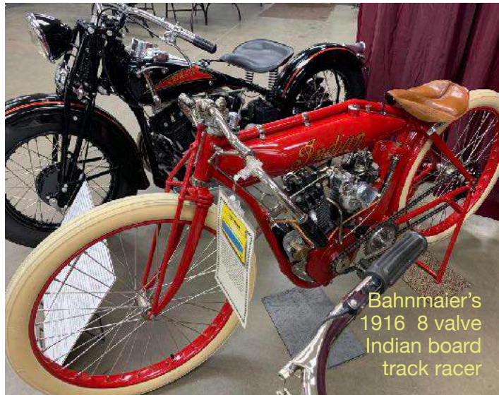
Bahnmaier's 1916 8 valve Indian board track racer