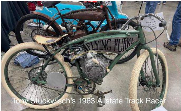
Tony Stuckwisch's 1963 Allstate Track Racer