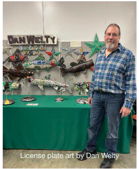
License plate art by Dan Welty