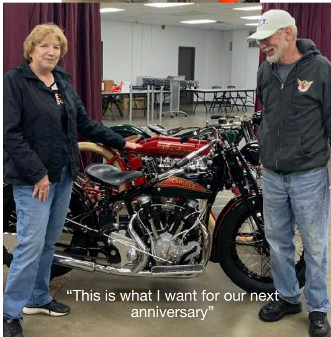
"This is what I want for our next anniversary"