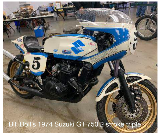
Bill Doll's 1974 Suzuki GT 750 2 stroke triple