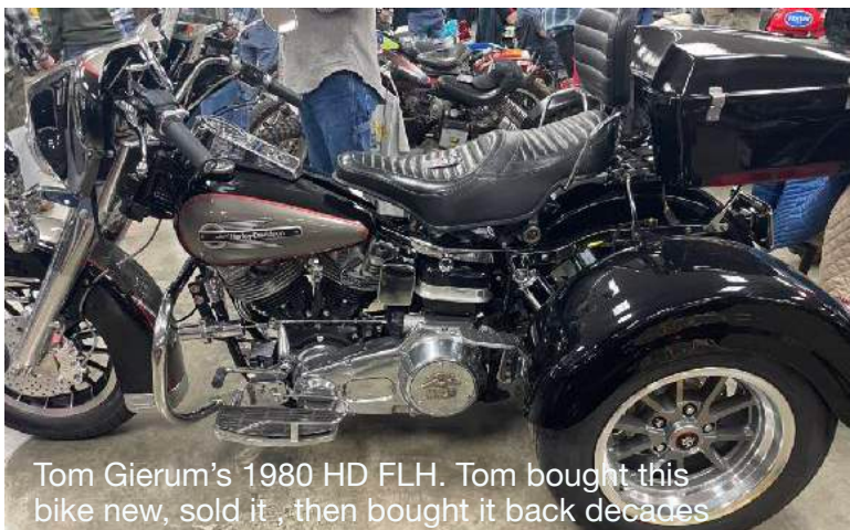
Tom Gierum's 1980 HD FLH. Tom bought this bike new, sold it, then bought it back decades later, and converted it into the trike you see here