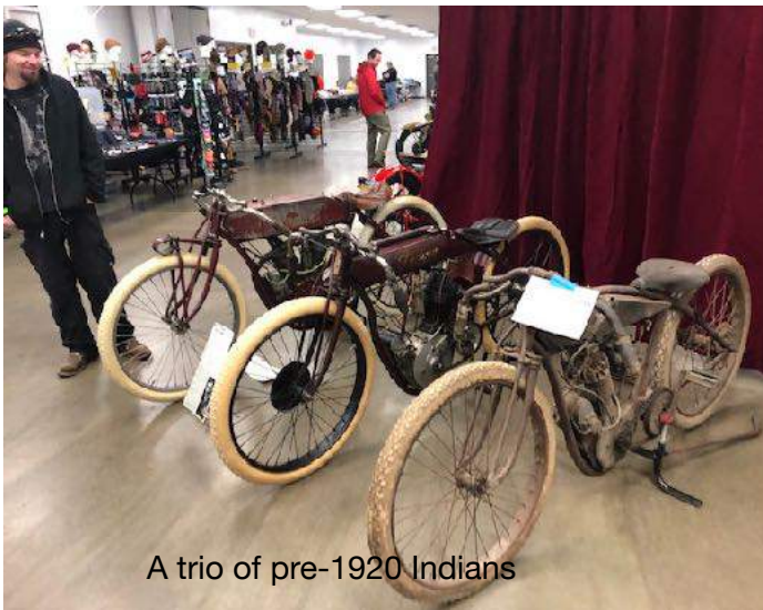
A trio of pre-1920 Indians