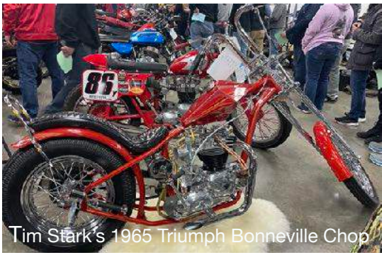
Tim Stark's 1965 Triumph Bonneville Chop