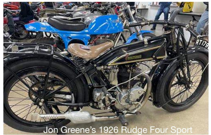
Jon Greene's 1926 Rudge Four Sport